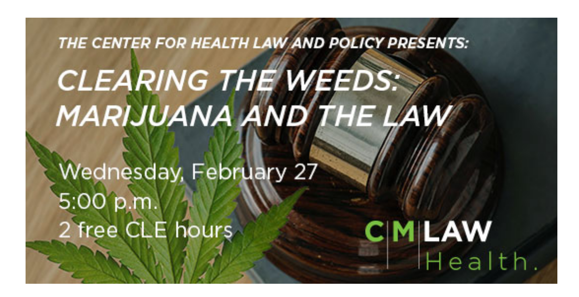
Learn More ▶