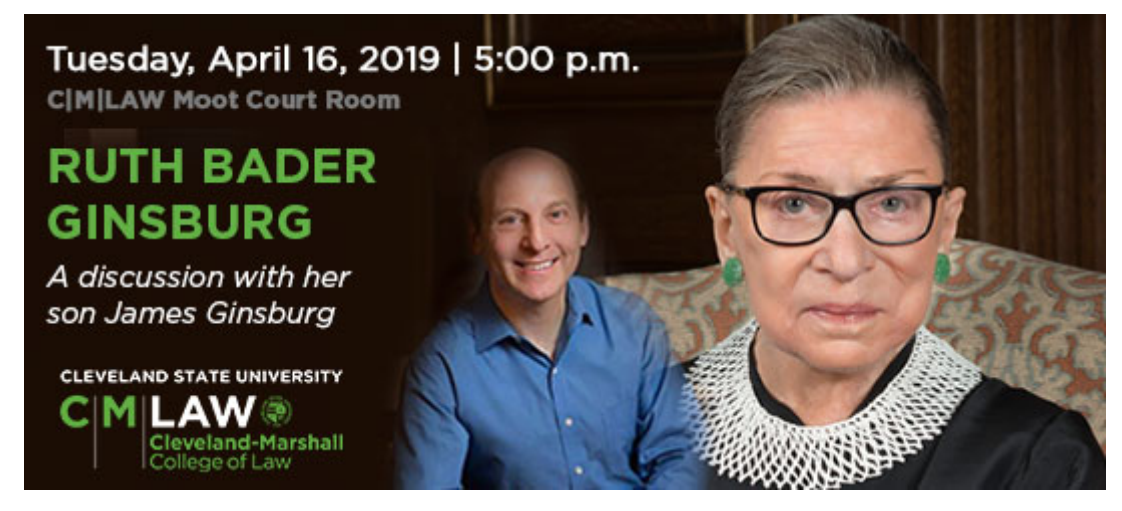
Learn More ▶